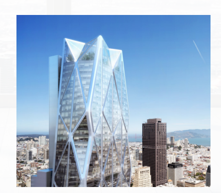
Oceanwide Center San Francisco, CA