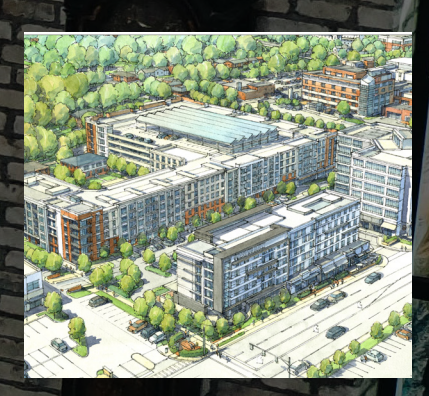
The Gallery at Kenwood Cincinnati, OH