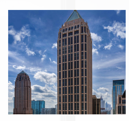
One Atlantic Center Atlanta, GA