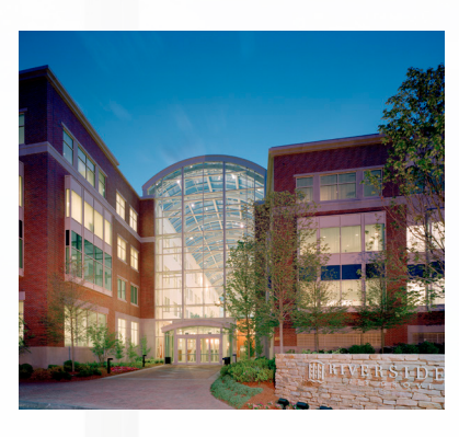
Riverside Center Boston, MA