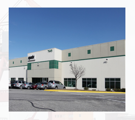
7445 New Ridge Road Hanover, MD