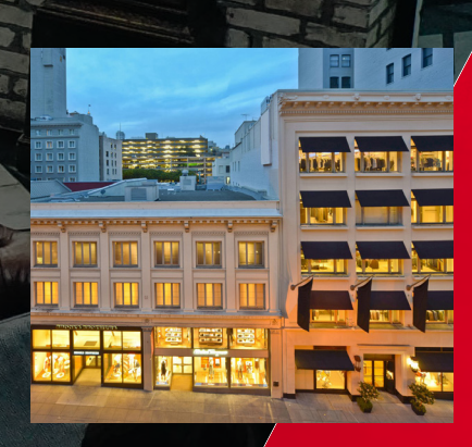
220 Post Street San Francisco, CA