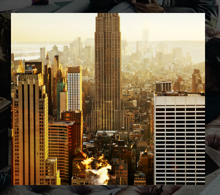
The Empire State Building New York, NY