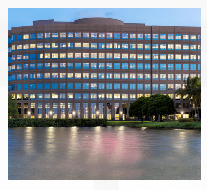
5505 Blue Lagoon Drive Miami, FL