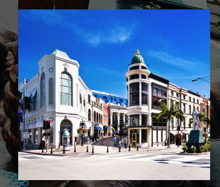
2 Rodeo Drive Beverly Hills, CA