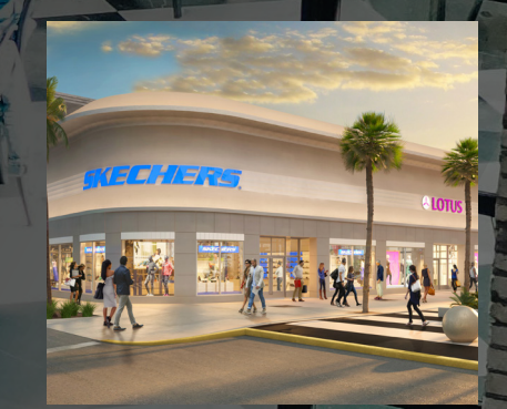
800 Lincoln Road Miami, FL