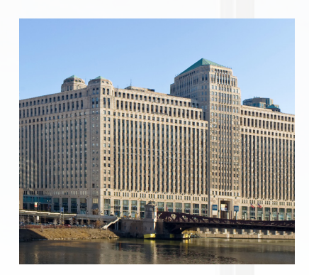
theMART Chicago, IL