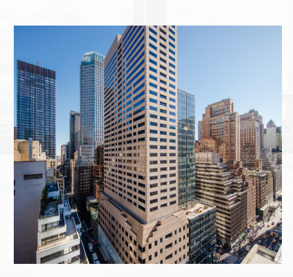
575 Fifth Avenue New York City, NY