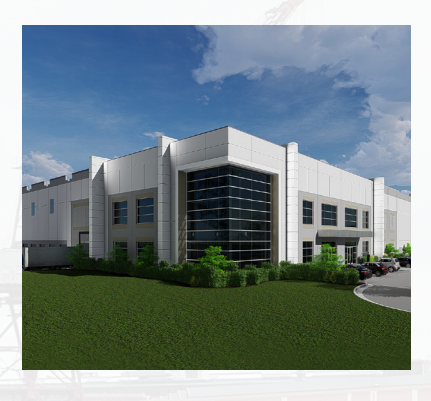
Southern Gateway at Lambert Farms McDonough, GA